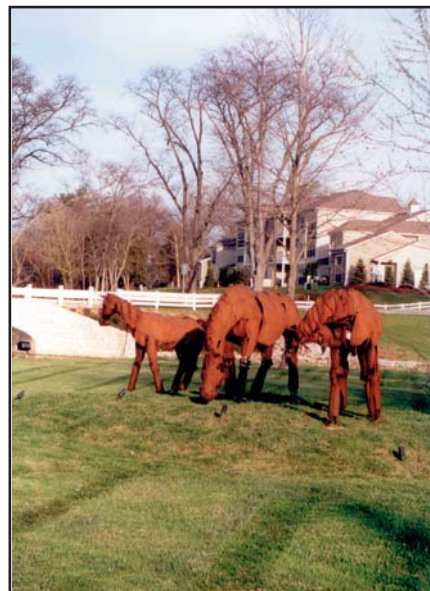
American Small Farm

Take time to be thankful for the little things in life.